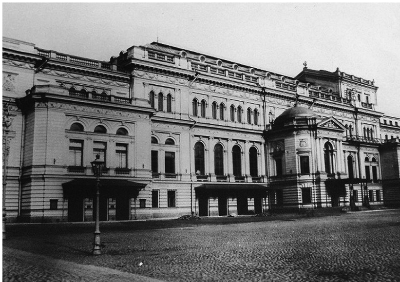
The N. A. Rimsky-Korsakov Saint Petersburg State Conservatory, c. 1900.